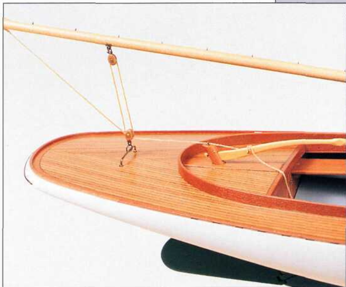
Figure 1, top. Sheet arrangement on PAULINE. The sheet runs through a fairlead on the head of the rudder stock to a horizontal snubbing pin in the tiller, thence to the helmsman's tiller hand. The rudderhead is reinforced against splitting with two through rivets. Also note the rudder strap and heel piece, tiller locking pin and diamond-shaped hand grip, the sheet horse pads, and the outboard end of the transom band.