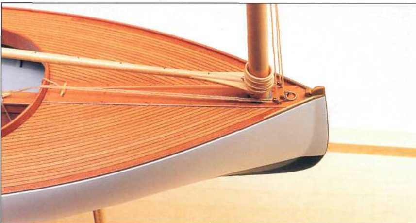
Figure 3, bottom. Bow of PAULINE. The stem-head carving is a Gil Smith trademark, as is the raised, beveled kingplank. The toerail is securely nailed into place; several rivets secure the jaws to the boom.