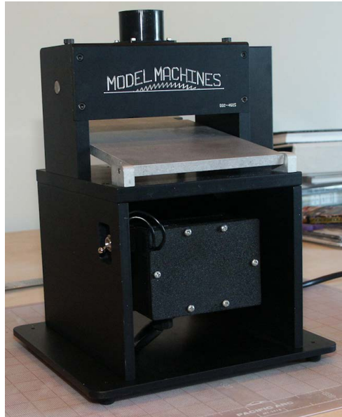
Byrnes Thickness Sander