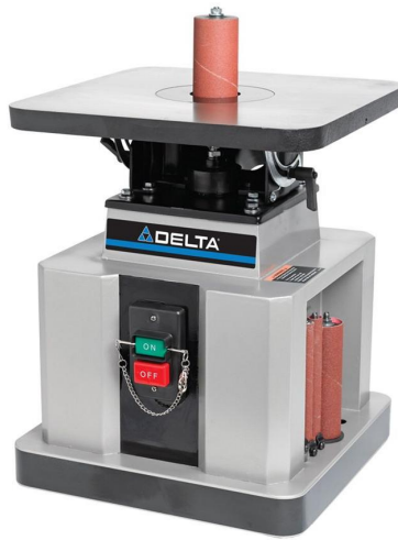
Delta Spindle Sander