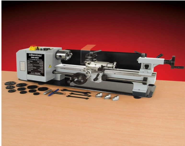
Variable Speed Lathe from Micromark with Change Gears