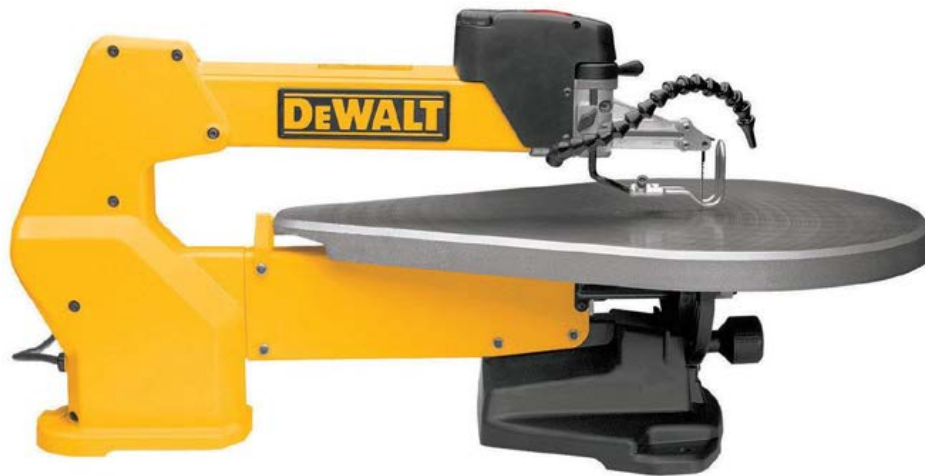
Dewalt Variable Speed Scroll Saw

Blades are usually pinless and are held in place by clamps in each arm. Ease of changing and tensioning the blade should be considered. Learning to choose the proper blade, blade tensioning, blade speed feed rate are important things to learn when using the scroll saw. The basic theory of operation can be learned from books but practice is essential in learning its use.