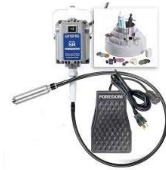
Foredom Flex Shaft Tool