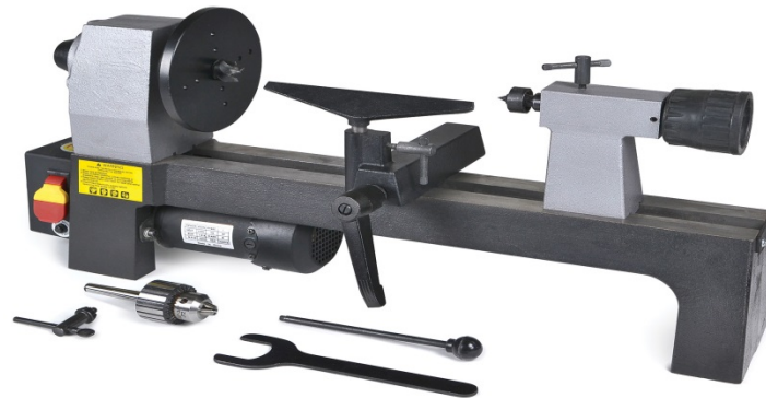
Jet Wood Lathe

study from books at a minimum. The wood lathe is good for turning masts, spars, spindles, buckets, barrels, deadeyes, etc. If equipped with an indexing plate the staves of the barrel can be accurately marked off. Wood lathes come in variable speed models or the speed can be controlled by changing a belt between pulleys.