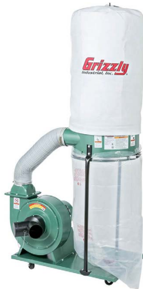
Grizzly 1 1/2 Hp Dust Collector