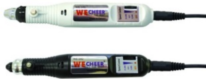
WeCheer Rotary Tools