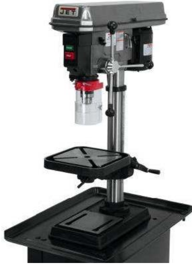
Jet Tabletop Drill Press