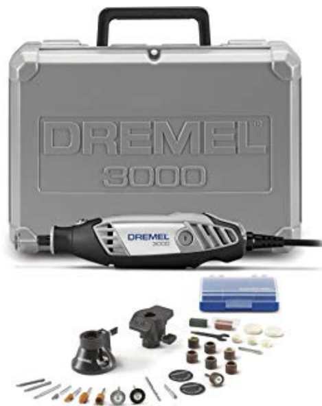
Dremel Rotary Tool

Another type of rotary tool has a remote motor with flex shaft driven hand piece. One popular brand is made by Foredom. Accessories are similar to or interchangeable with the Dremel style tool. One might also consider some of the smaller, less powerful, hand held tools intended for light carving duty. These turn at RPM's equal to Dremel style tools but don't have the power or torque. They are however much lighter and smaller in the hand and can be easier to control. An example are those made by WeCheer. Safe use is fairly intuitive. Always wear safety glasses when using and carefully control the tool to prevent injury.